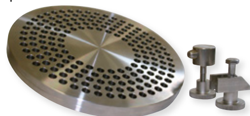
Examples for application