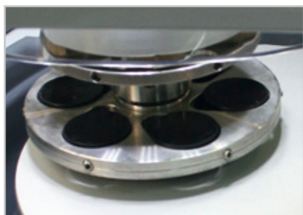
Central pressure requires levelled samples