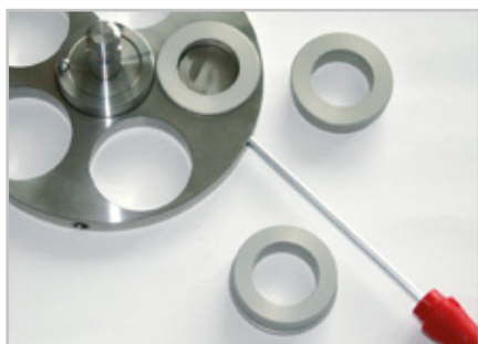
Insert suitable distance rings